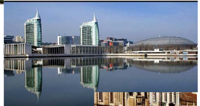
Old & Modern Lisbon