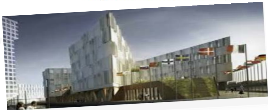
The UN City