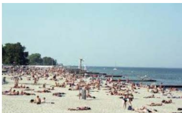
Bellevue Strand, Klampenborg