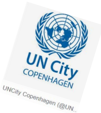
UNCity Copenhagen (@UN..