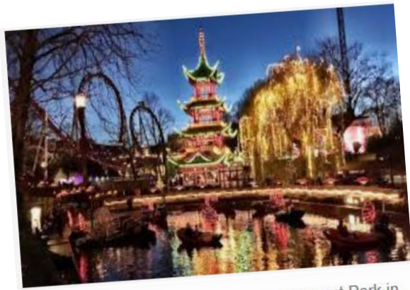
Visit the Tivoli Gardens Fun Fair Amusement Park in...