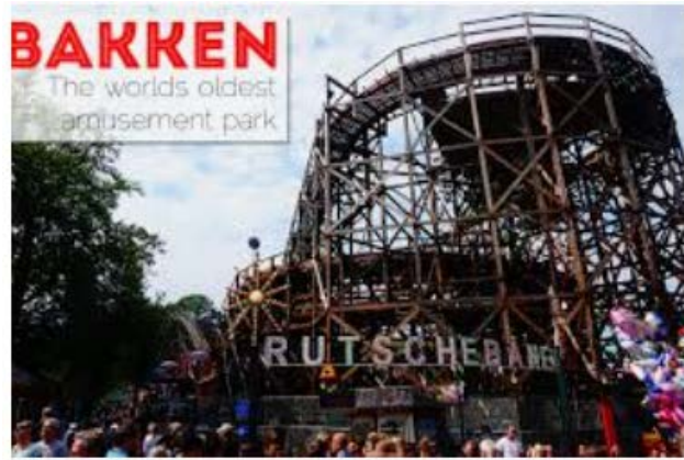
Visiting the worlds oldest amusement park - ...